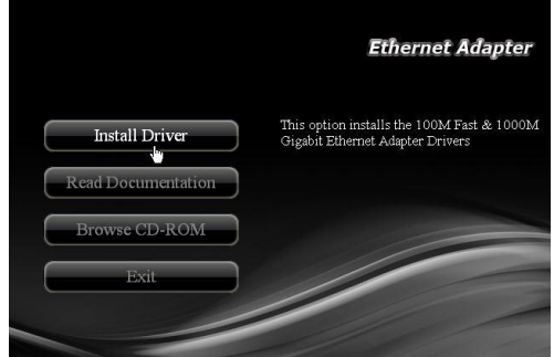
*Note: Actual image may vary

Note: If the install program doesn't run automatically, please locate and double-click on the Autorun.exe file in the CD to launch the install program.